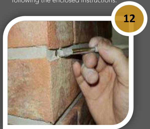
Finally, carefully place the mortar compound over all screw holes to ensure no part of the screw is visible.