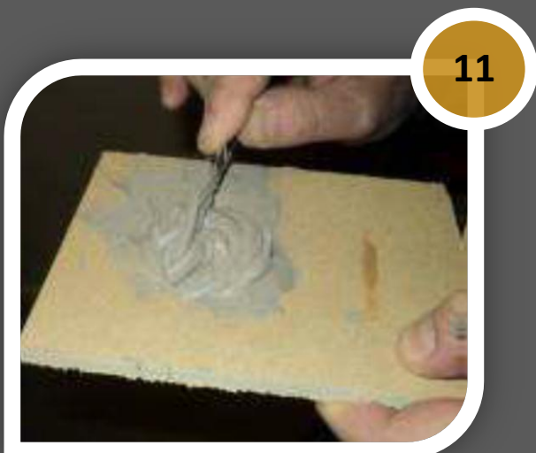
Ensure that when mixing the mortar compound you create an even colour with no streaks and an even consistency.