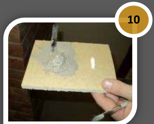
Mix the provided mortar compound following the enclosed instructions.