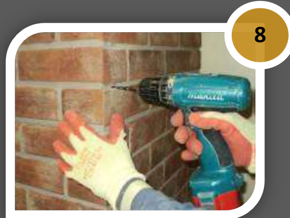
Repeat steps 4 & 5.