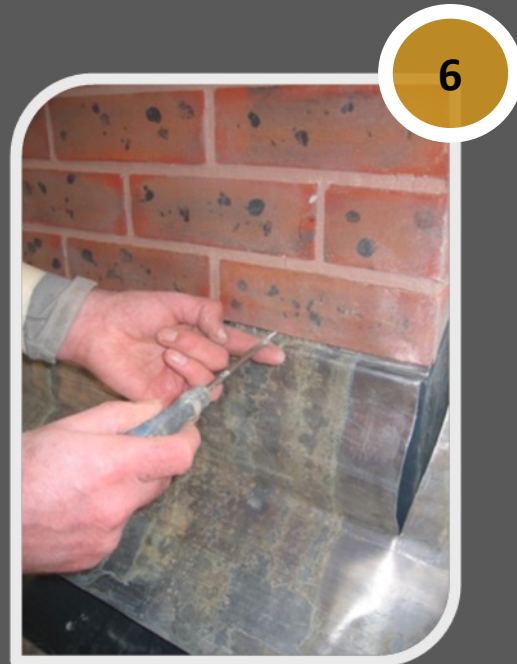
Fix lead in place with domed-head screws