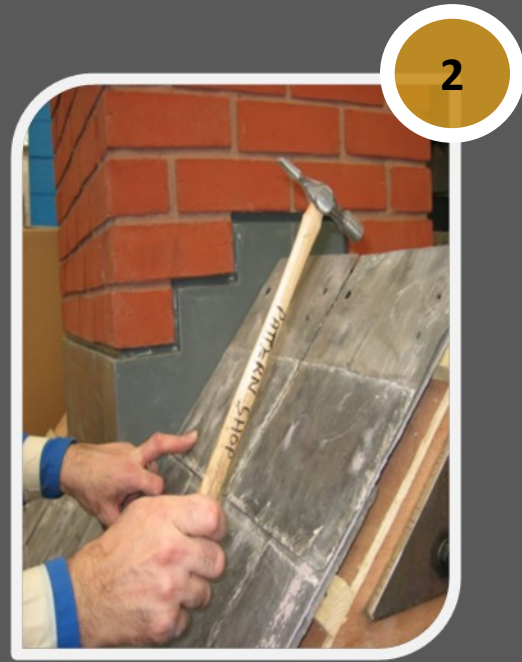
Nail tiles/slates to lath, ensuring they butt up to grey chimney upstand