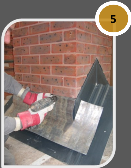
Drill through lead and into grey GRP upstand