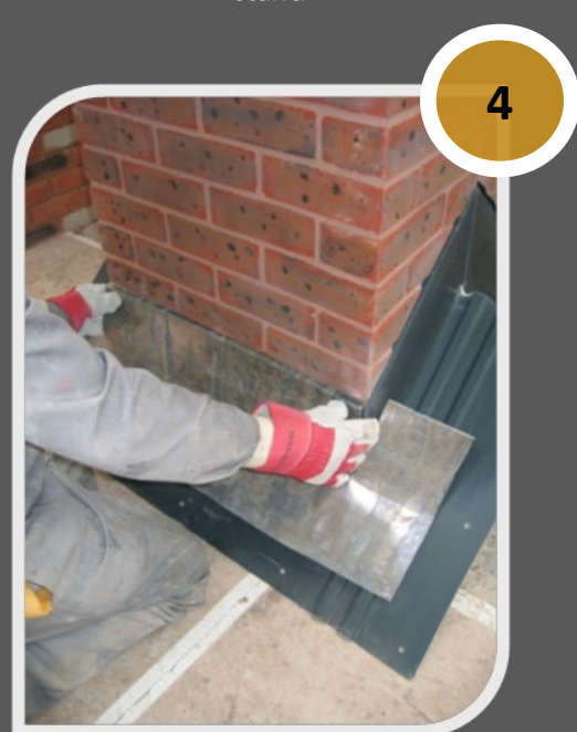
Tuck lead flap up under GRP brickwork