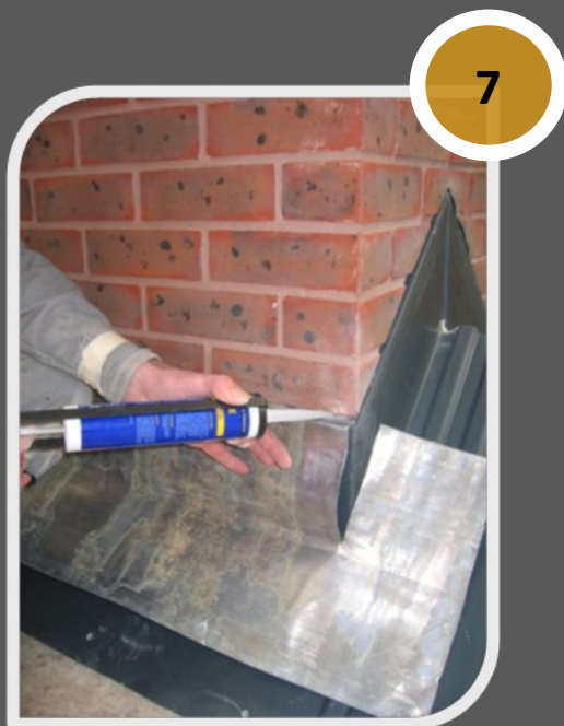
Run a bead of lead mastic along the recess covering the screw-heads